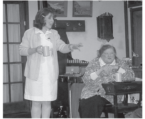
"Dr. Cook's Garden" runs through January 31 at the Greenbelt Arts Center. Curtain time is 8 p.m. on Fridays and Saturdays and 2 p.m. on Sunday, January 25.