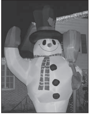
This snowman delivers his own greetings to passersby at 228 Lastner Lane.

Around this time of year it has been traditional for the youngsters who deliver the News Review to leave holiday greetings envelopes at the homes they serve. The News Review's financial position is such that we cannot pay our carriers very much. They are therefore dependent on generous holiday donations to supplement their nominal pay.