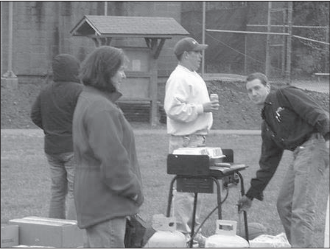
St. Hugh's CYO ran the grill.