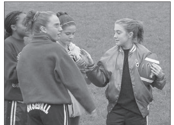
Above, 7th grade girls discuss strategy.