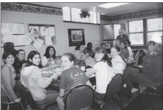
Leaf-rakers from Eleanor Roosevelt High School enjoy a pizza lunch in the Greenbelt Homes, Inc. staff lunchroom. The students, all members of the Civitan Club, spent the morning of November 22 raking leaves for members of GIVES who had sought assistance.

the Greenbelt Intergenerational Volunteer Exchange Service. Most members of the organization are senior citizens who offer services to others in exchange for similar or different services for other members. The most frequent request is for transportation, usually to a physician's office; however, the organization also has a great need for persons willing to handle phone calls, either in the GIVES office in the Community Center or from their personal phones. All services are provided free and membership is also free. For further information call 301-507-6580.