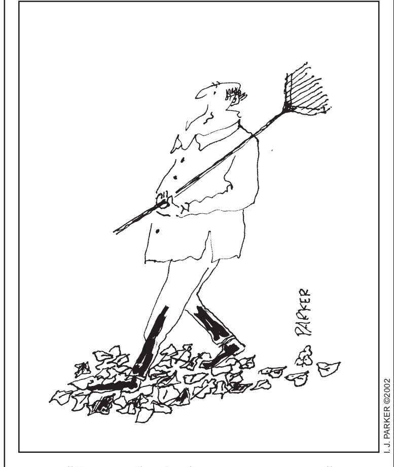
"Next year I'm planting evergreen trees . . . . "