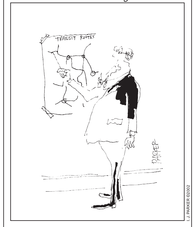
"... and this is the 'Purple Line,' also known as the thinking man's 'Intercounty Connector'!"