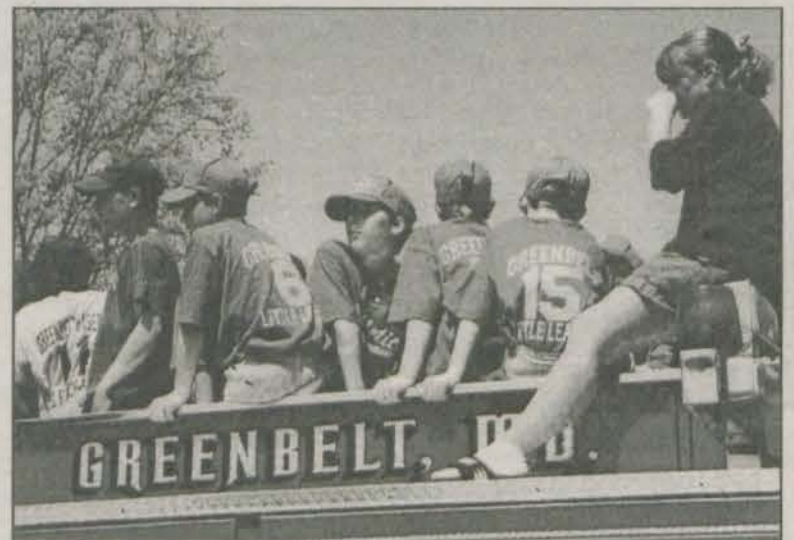
For the opening day parade for the fiftieth Greenbelt Cal Ripken League season on April 22, members of the Athletics Team rode a fire truck.

7:30 p.m., Advisory Planning Board Meeting, Community Center.