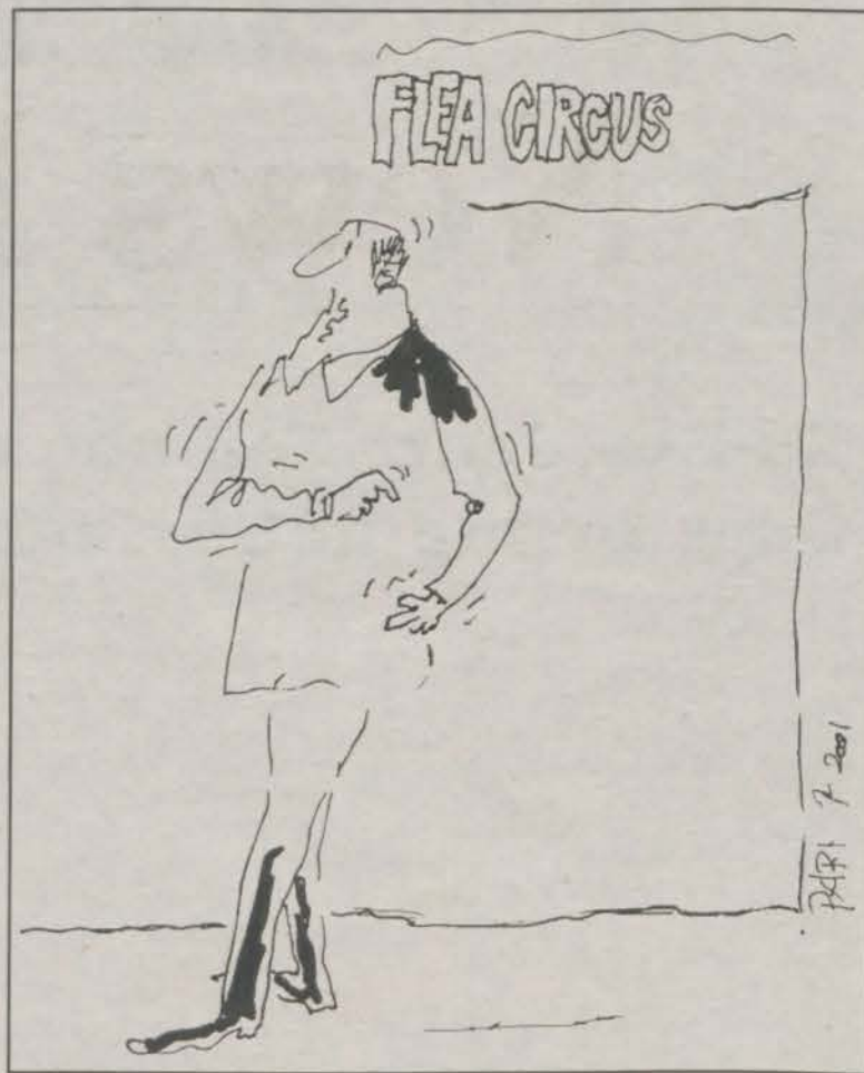
"I hope I'm not walking away with the circus!"

form of paid entertainment in Greenbelt is taxed to help the city with among other things, improvement to the cultural and physical environment. We don't actually disagree on this subject. I just have a broader view that shows where an occasional flea circus fits in with the ongoing experiment of Greenbelt. It's a wonderful thing when we can grow in our understanding of things, and learn to appreciate our "opponent's" point of view, whether or not we can agree with it or even condone it.