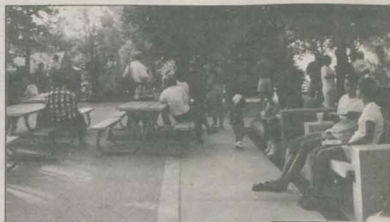
Concert goers had snacks or drinks or just listened to the music at the New Deal Café Music Festival at Roosevelt Mall July 1.

On Saturday August 12 join in some environmentally conscious games at Greenbelt Park. If it is too hot, there will be role-playing games at the Ranger Station. Children of all ages are welcome. Parents and/or guardians must be present during the hour-long program. Meet at the Sweetgum picnic area at 3 p.m. For information call 301-344-3944.