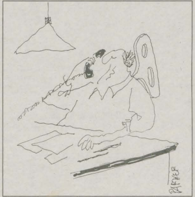
"You can rest assured the News Review is Y2K compliant..." Thursday, December 16, 1999