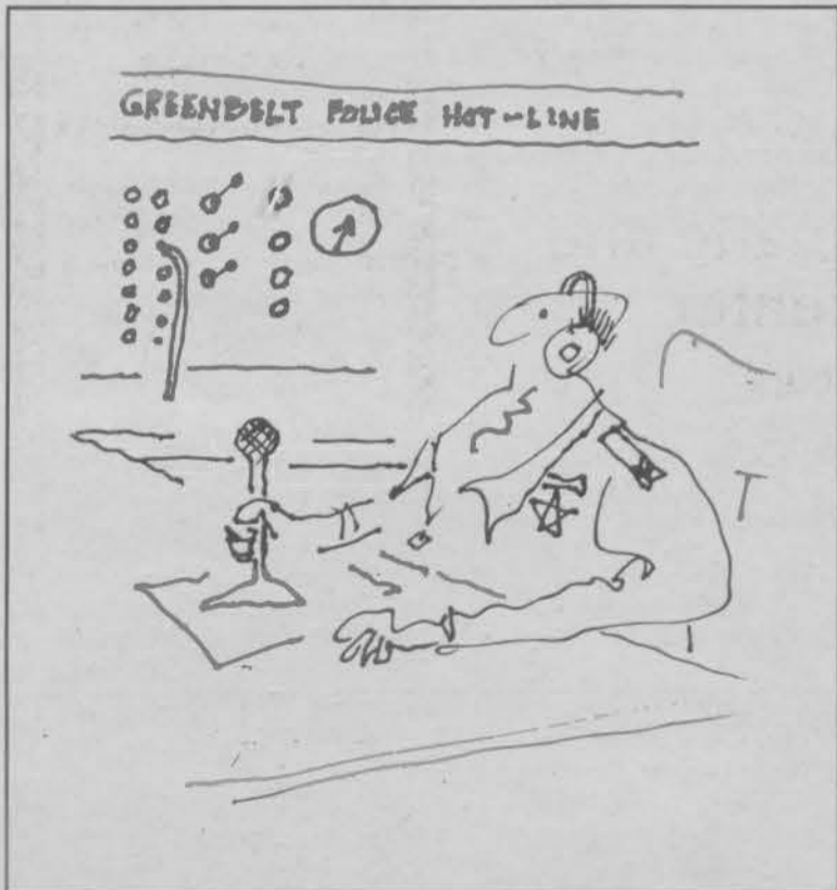
Calling all bicycles...Calling all bicycles...