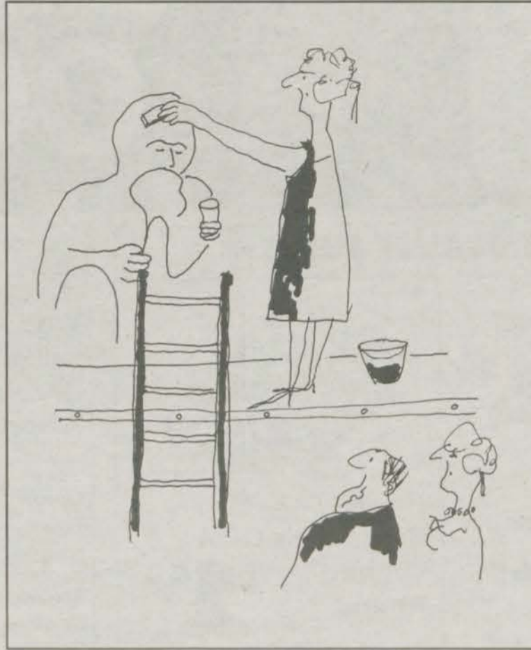
"She's using Lancome on the Mother and Desitin on the Child!" -Thursday, May 27, 1999