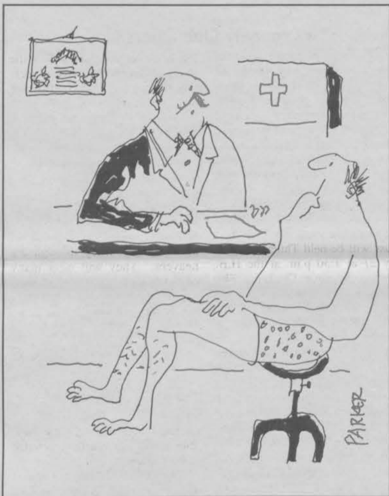
"I turned 80 yesterday...I want to know if I'm Y2K compatible!"