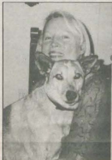
"King," the Singing Dog.

***** * The Staff * * of the * * News Review * * Wishes our * * readers * * Happy Holidays * * and a * * Bright New Year * *****