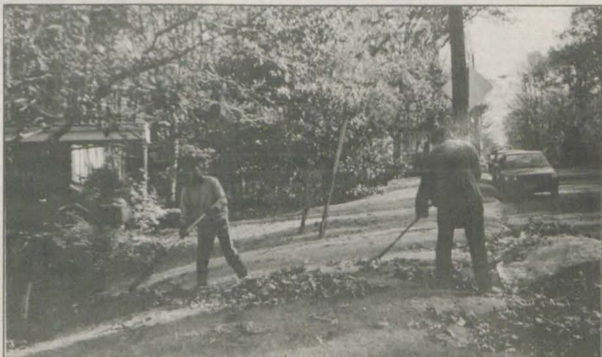
Junior Civitan members raking.