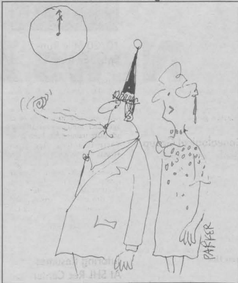
"We don't have to worry about Y2K...We don't own a computer...Why did the clock stop?"