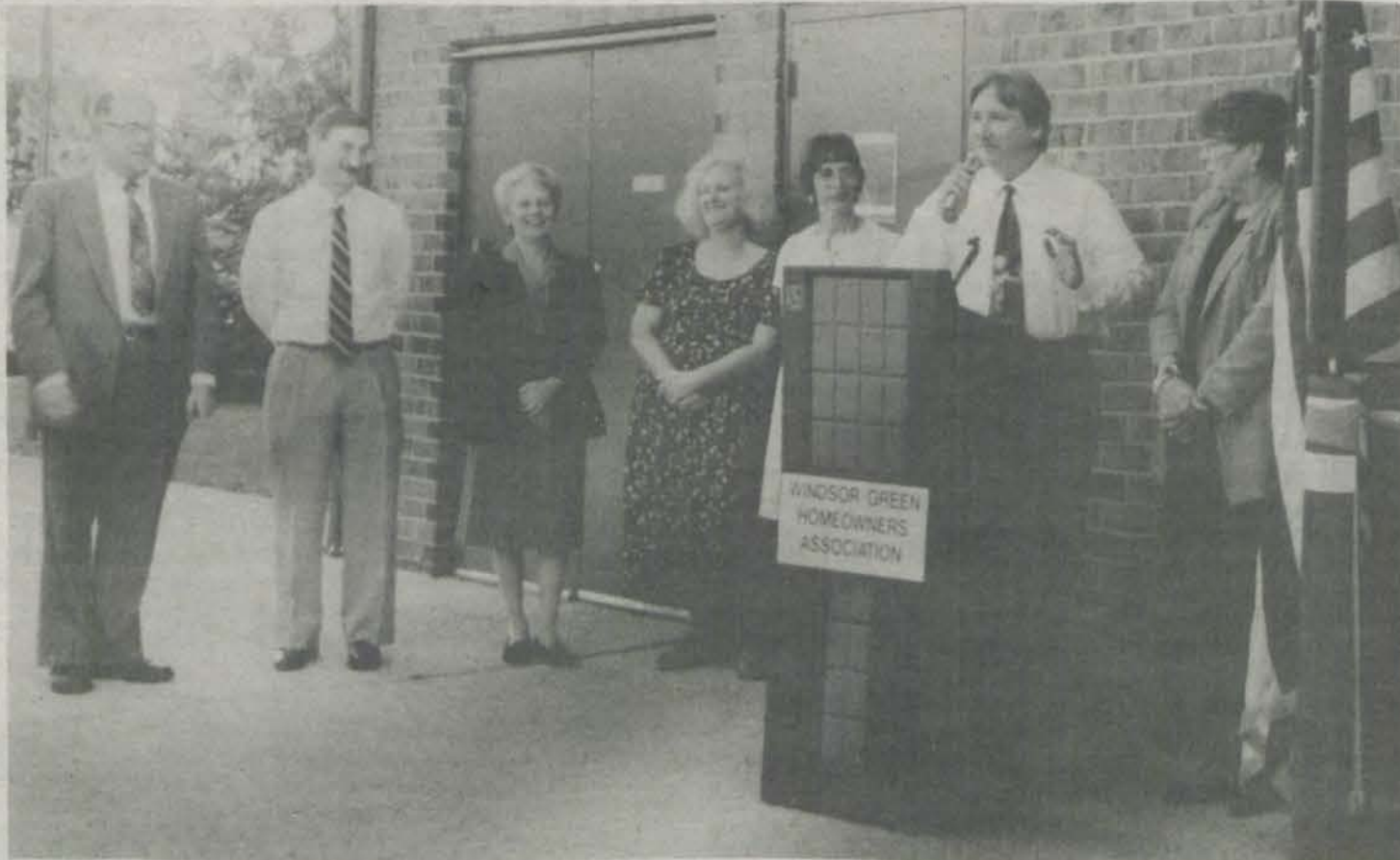
Opening of police substation in East Greenbelt

Community policing, police bicycle patrols, police substation at Beltway Plaza and East Greenbelt, two-tiered refuse collection system, on-going investigation into appropriate methods to preserve the remaining Green Belt forest.