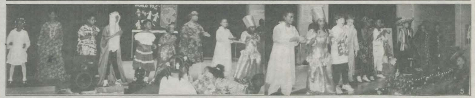
Children show their clothes from many lands in Greenbelt Elementary School's After School Program's fashion show