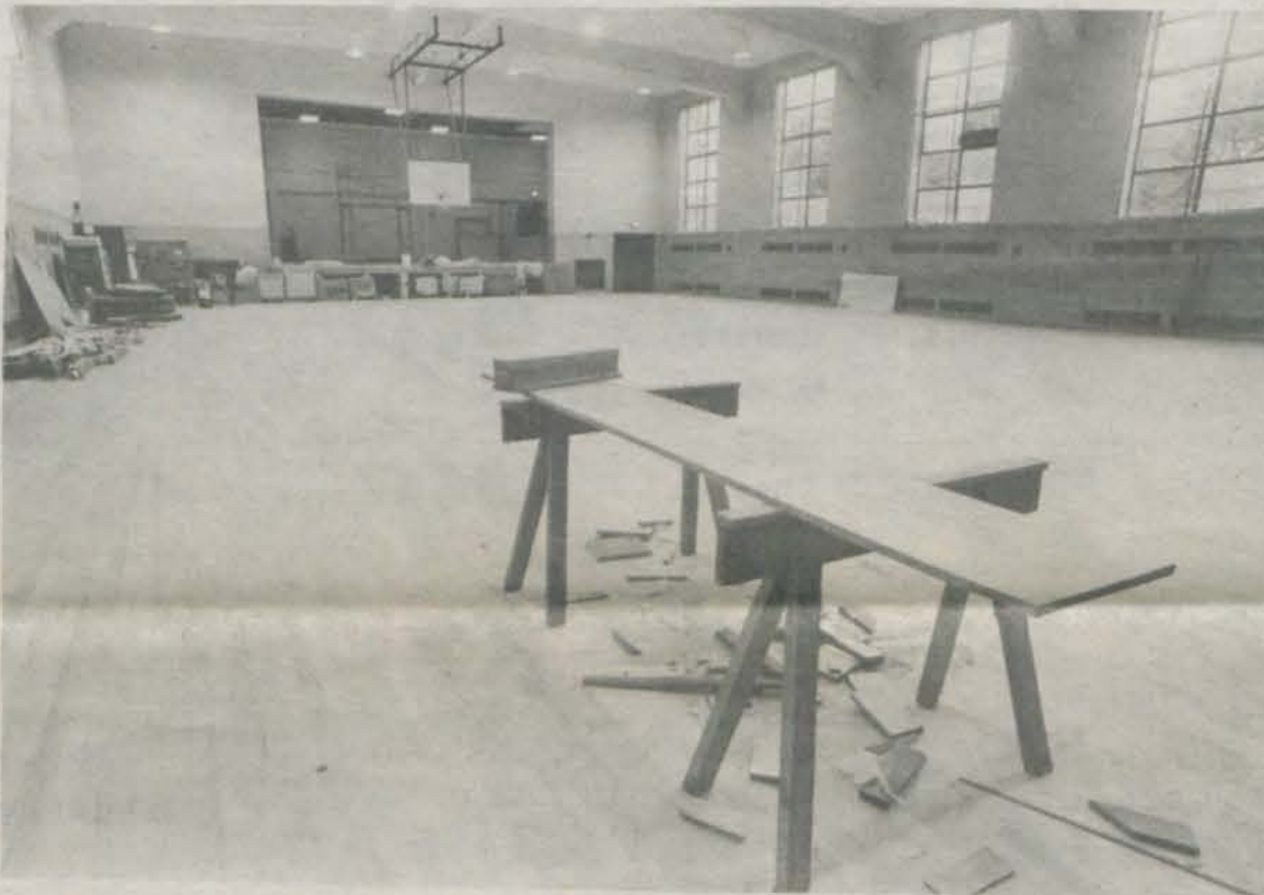
Gymnasium receives a face lift in preparation for Community Center Opening.