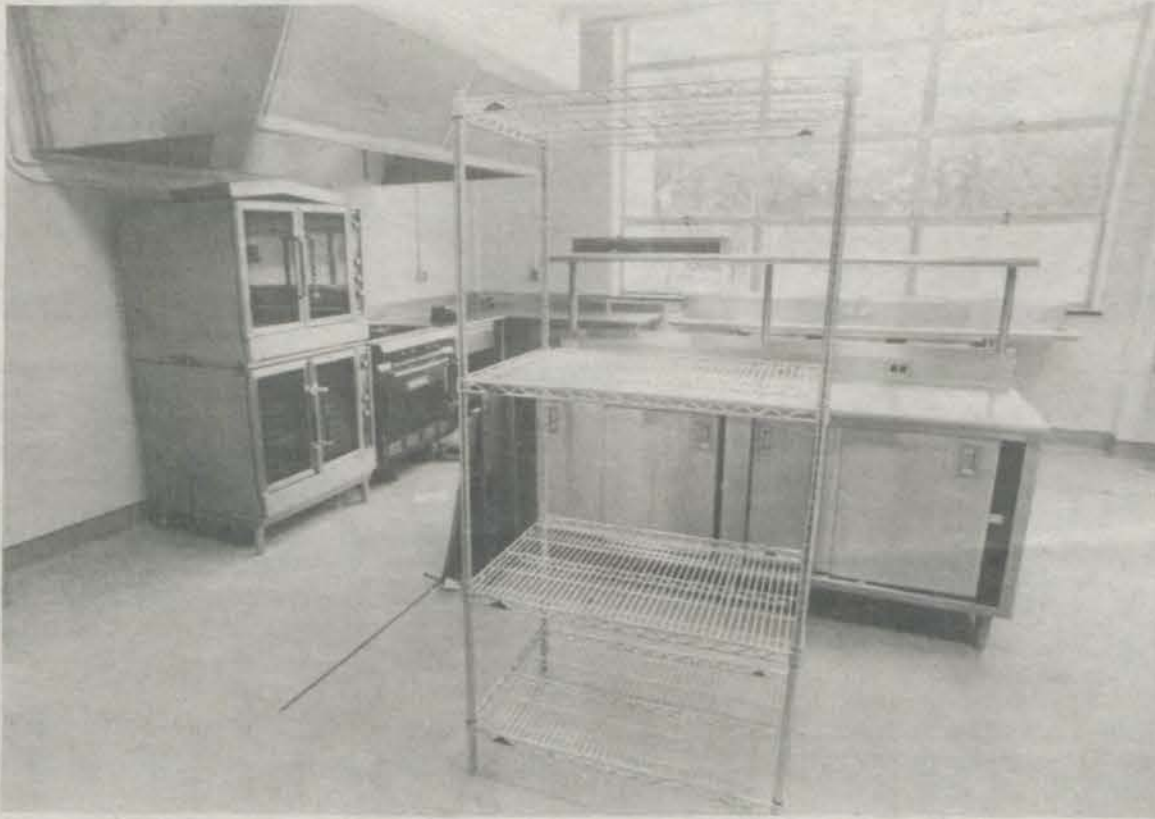
The kitchen of the new Community Center will serve seniors a hot meal and provide food preparation space for The New Deal cafe

Viewed from the outside, the Community Center has the same white walls, bas reliefs, green doors and glass blocks. From the