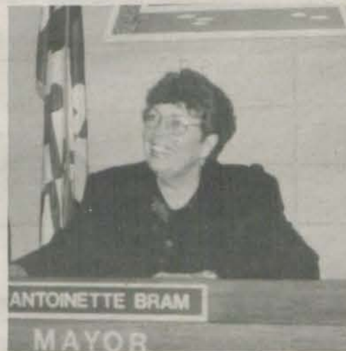
Mayor Toni Bram chairing a Council meeting.