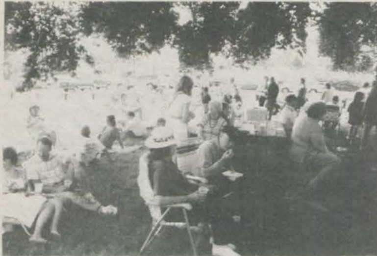
Relaxing, Refreshing, Reflecting - the Greenbelt Way on Greenbelt Day.