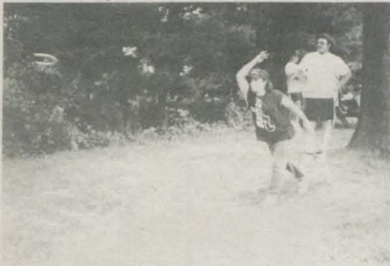
Will it be a ringer?