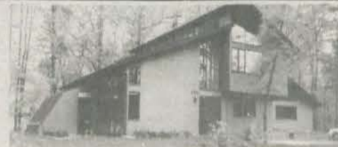
155 Research Rd., Greenbelt Solar Deck House

Register your kid now for Transportation to Summer Camps, Summer Schools, Sports Clinics, Organized Field Trips by Day Cares Call us Today: (301) 345-9420 or (301) 230-5549