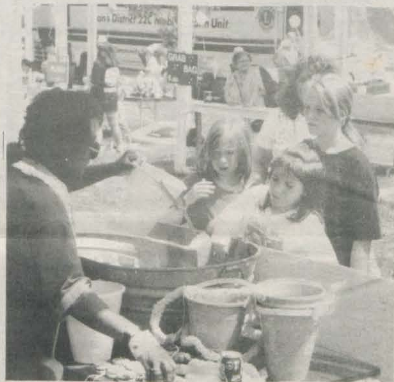
Hmm, which one shall I pick?