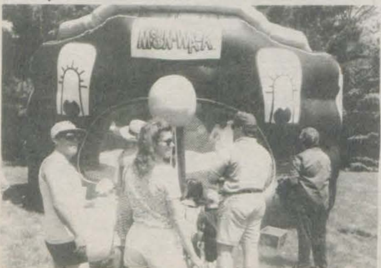
The Moon-walk is always a hit!