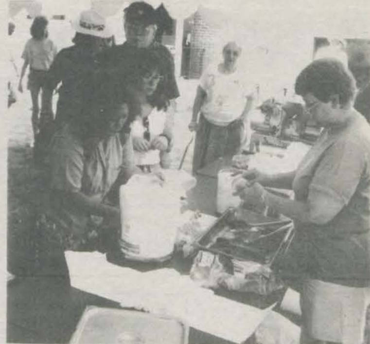
"Hot dogs and Hamburgers" Greenbelt Day the American Way.