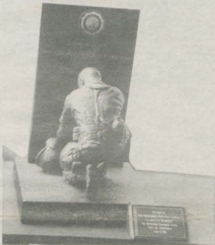
"Honoring all who sacrificed for our freedom" sculpture presented to American Legion Post 136 from City of Greenbelt.