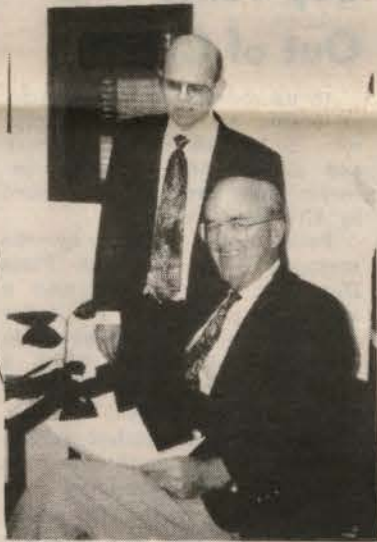
Senator Leo Green files for re-election to the Maryland Senate. Campaign Manager Phil Scheckels (standing) is shown with the senator.