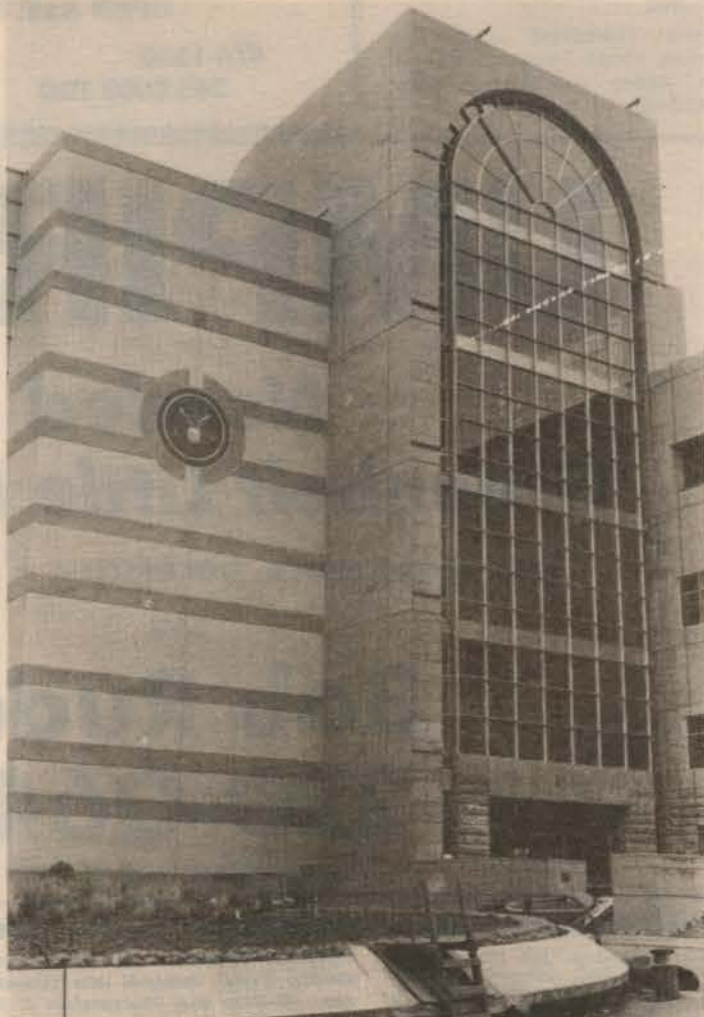
The arched main portal of the new Federal courthouse, seen here from the entrance plaza, leads to an inner atrium that rises to the roof. The wall on the left, paneled in golden buff stone from Minnesota, bears the Great Seal of the United States in black granite.