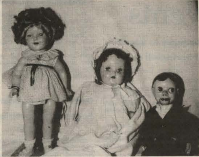
Three historic dolls "Shirley Temple," a baby doll and "Charlie McCarthy" (left to right) that will be on display in the doll exhibit at the Greenbelt Museum opening April 17. The exhibit features toys from the 1930s and 1940s.