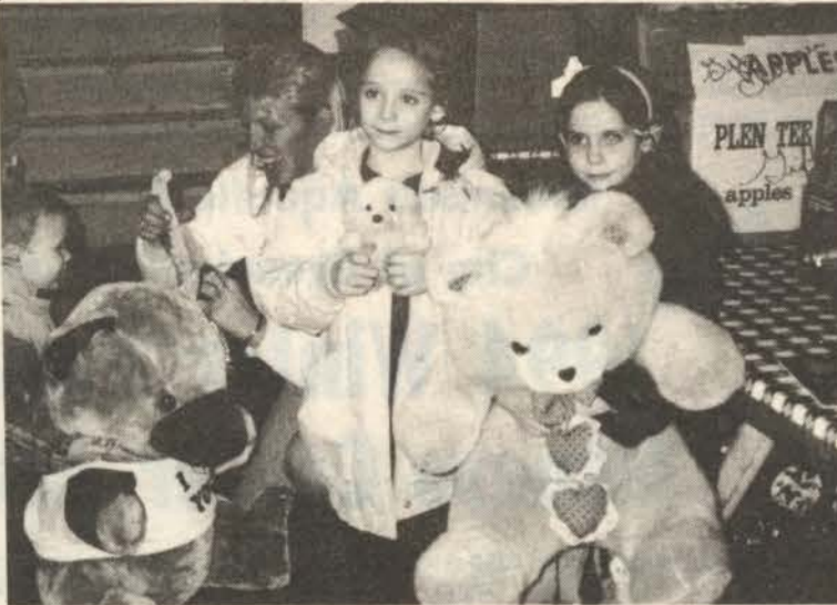
Midwest flood victims in Quincy, Illinois, opening gifts from the Greenbelt Lions' Holiday Sleigh.

Moved by the TV coverage of midwesterners working feverishly to sandbag river banks, trying to save their homes, farms, and businesses from the raging waters, I had searched my mind for a way to help. Finally, my husband and I had selected a town on the Mississippi, directly off route 70. We called a Lions