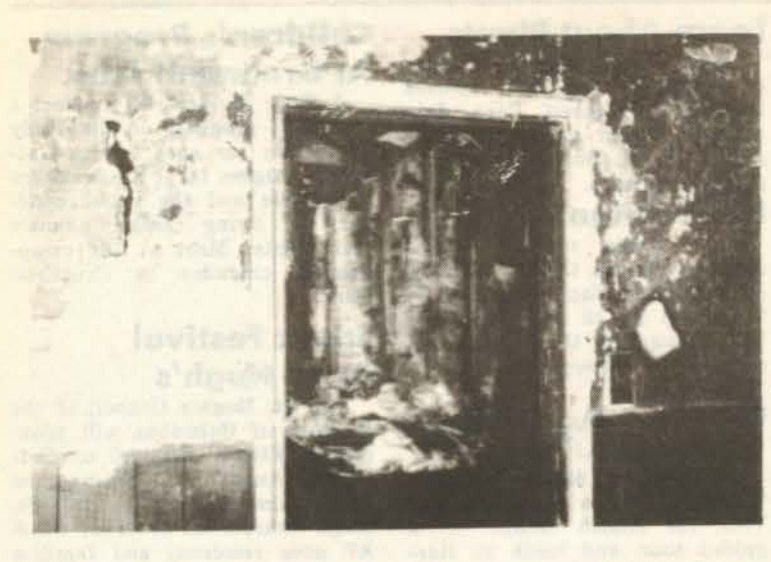
Fire gutted the home at 10-F Plateau Place leaving everything charred and blackened.