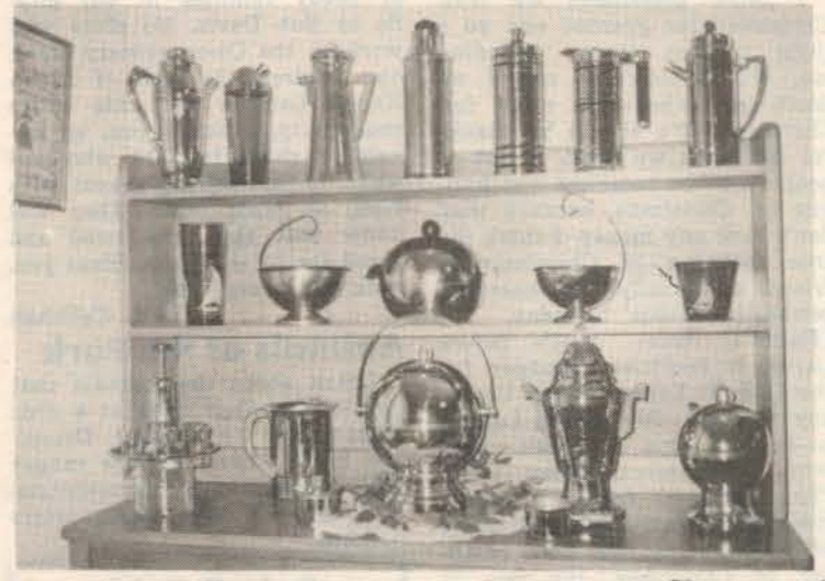
Glass exhibit now through February. Greenbelt Museum features a special Art Deco Chrome and

Recyclables will be collectted on their regular schedule that week.