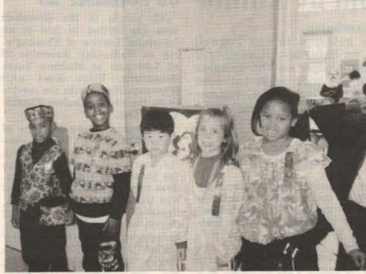
Center School children wearing multi-cultural costumes take part in Halloween festivities.

The Baltimore Citywide Insurance Coalition, composed of 164 organizations, has been working several years on forming a statewide insurance cooperative to achieve substantial reductions in auto insurance rates for customers. Come and learn about this organization. All ages are invited. Refreshments will be served.