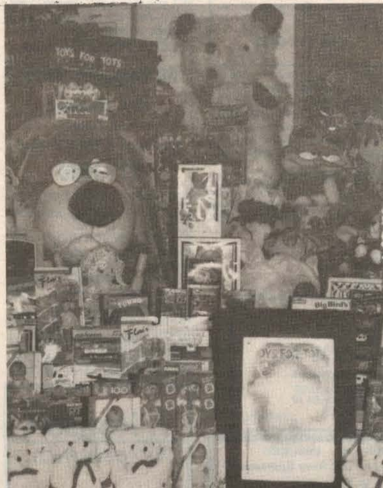
The Prudential Preferred Properties collected 500 toys valued at $5,000 for this year's Toys For Tots program, sponsored by The Marine Corps Reserve. Shown here are just a few of the toys collected.