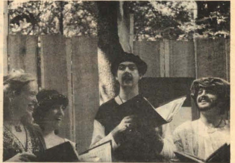
Musikanten, a Renaissance Choral Group, will be appearing for one performance only, Thurs., Dec. 19, at the Greenbelt Arts Center's Utopia Theater. The group is presenting a seasonal concert, done in costume.

There is no charge and the public is invited. Just bring a hot dish, salad or a dessert.