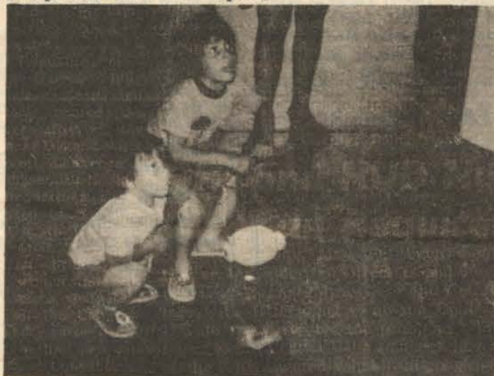
Olo the safety robot captivates its audience.