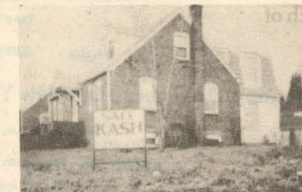
LARGE HOME IN COLLEGE PARK: Excellent location and comes with 5 bedrms, 2 full baths, formal din-rm. Could be 2 sep. units. Rec-room and garage also.