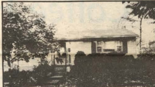
YES YOU CAN: still buy a 3 bedroom, 2 full bath, lovely rambler for under $62,500 VA appraised. Owner will pay most of closing costs. Featuring large rec. room, cen-OSP and nice treed yard. You can buy on FHA terms with as little as $300 down payment or no down payment on VA terms. Call us now to see this fine home. 345-2151.