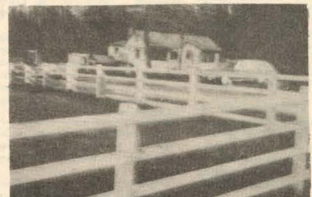
FARMETTE: 2 acre tract, white ranch fence, barn, out-building, 4 bedrm., 2 baths, sep. din. rm., modern TS kit., fireplace, lg. patio, & pool. Only $79,500, call now.