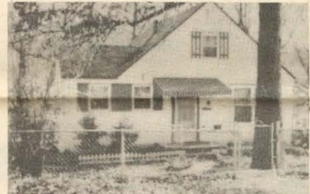
8 1/2% V.A. LOAN: ASSUME this VA loan and your total payment is only $336. per month. 4 bedrm., full basement. $46,950.