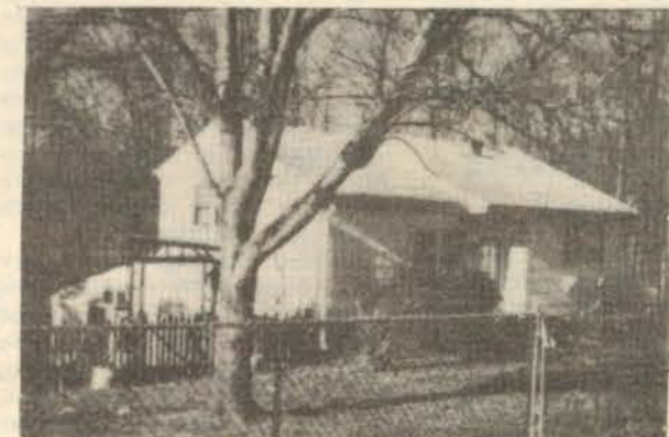
HUGE ADDITION: Makes this home ideal for the growing family. Washer, dryer, w/w carpet & fenced yard. $300. down FHA or no down VA.