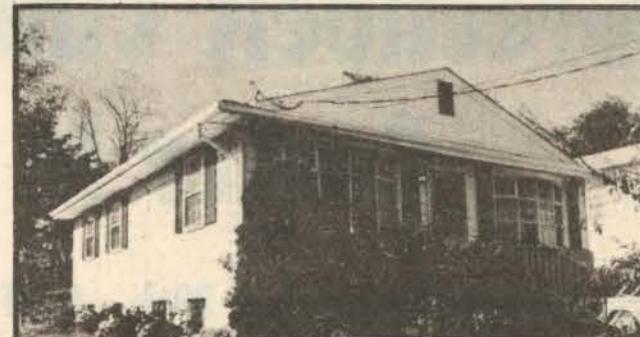
BELTSVILLE BEAUTY!!! Just reduced for fast sale. This 4 bedroom, 2 full bath rambler with large rec room won't last long. Featuring central air conditioning, storm windows and doors, wall-to-wall carpet, washer, dryer, dishwasher, and fenced yard. FHA or no down VA terms at a total price of only $62,950. Sounds good? It is, call 345-2151.