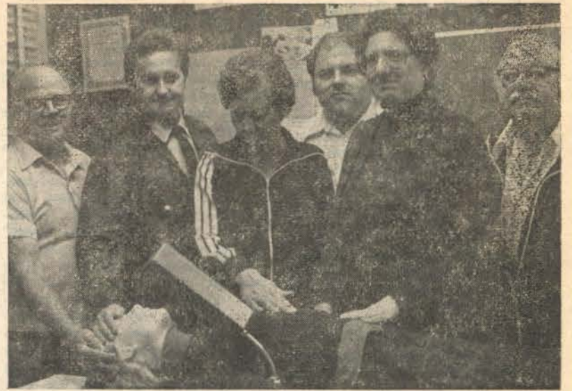
Members of Greenbelt's Cardio-Pulmonary Resuscitation (CPR) Committee huddle over "Resusci-Annie", the life-sized doll used in the CPR classes.

The Greenbelt Municipal Building is accessible to the handicapped.