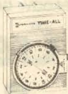
Intermatic Time-All. 24-hour automatic lamp and appliance timer. Three to be given away each week.