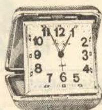
Seth Thomas "Travatur" Alarm. Raised brass numbers and luminous hands. Three to be given away each week.

Deposits insured by an agency of the Federal Government. On certificates of deposit, early withdrawals result in substantial interest penalty.