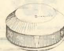
Intermatic Time Keeper. One to 60 minutes. Great for household use. Three to be given away each week.

Ingraham Electric Wall Clock. Attractive for kitchens. Three to be given away each week.