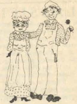
Harridan and Sot

Senate hearings have just ended on the Co-op Bank Bill (S. 1010) which, if passed, would establish an independent bank to make loans to consumer cooperatives and provide technical assistance.