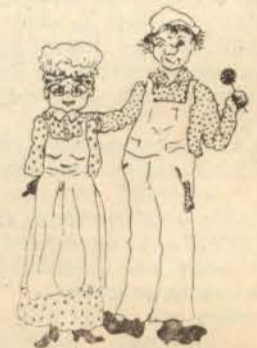
Harridan and Sot