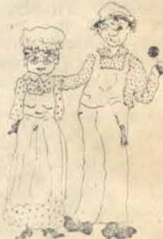
Harridan and Sot