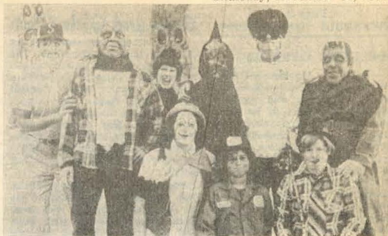
Recreation Department staff spooks it up at the annual Halloween Costume Parade and Party.

Prior to the dedication on Saturday the Washington Capitals will conduct a practice scrimmage from 10 a.m. - 12 p.m. The entire program is open to the public.