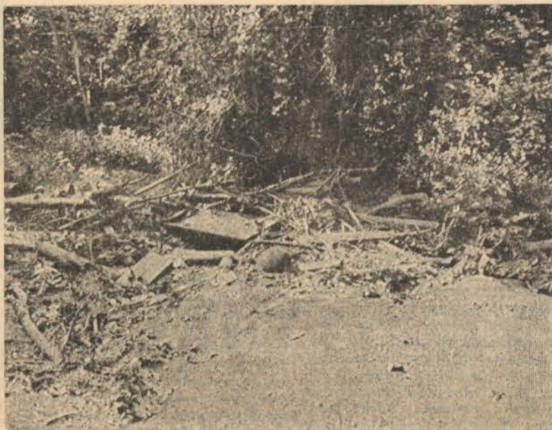
View of one of the creeks that feed Greenbelt Lake. It is clogged with debris and trash.

Saturday, Sept. 19, 9:30 a.m. Lake clean-up. Meet at Lake parking lot. Tuesday, Sept. 22, 3:30-5:30 p.m. Registration, Recreation Dept., Youth Center. Wednesday, Sept. 23, 3:30-5:30 p.m. Registration, Recreation Dept., Ridge Rd. Center. 7:30 p.m. Folksing. Greenbelt Library. Thursday, Sept. 24, 3:30-5:30 p.m. Registration, Recreation Dept., SHL School. 8 p.m. Citizens for Fair Housing, Greenbelt Library.