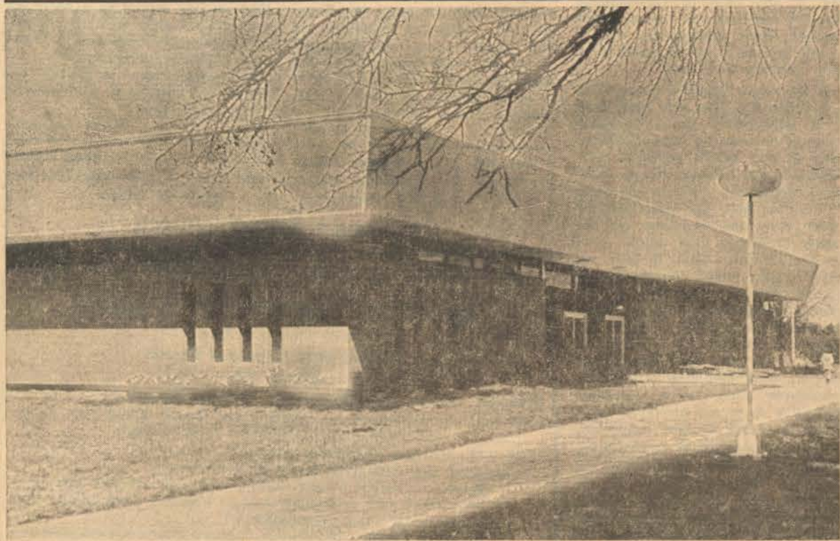
View of the new Greenbelt Library as seen from Crescent Road. Dedication ceremonies were held on Tuesday, April 7, 1970.

City Manager James Giese cautions residents to observe all temporary parking restriction signs on the streets being resurfaced. Cars in the way of resurfacing will be towed away at the owners expense.