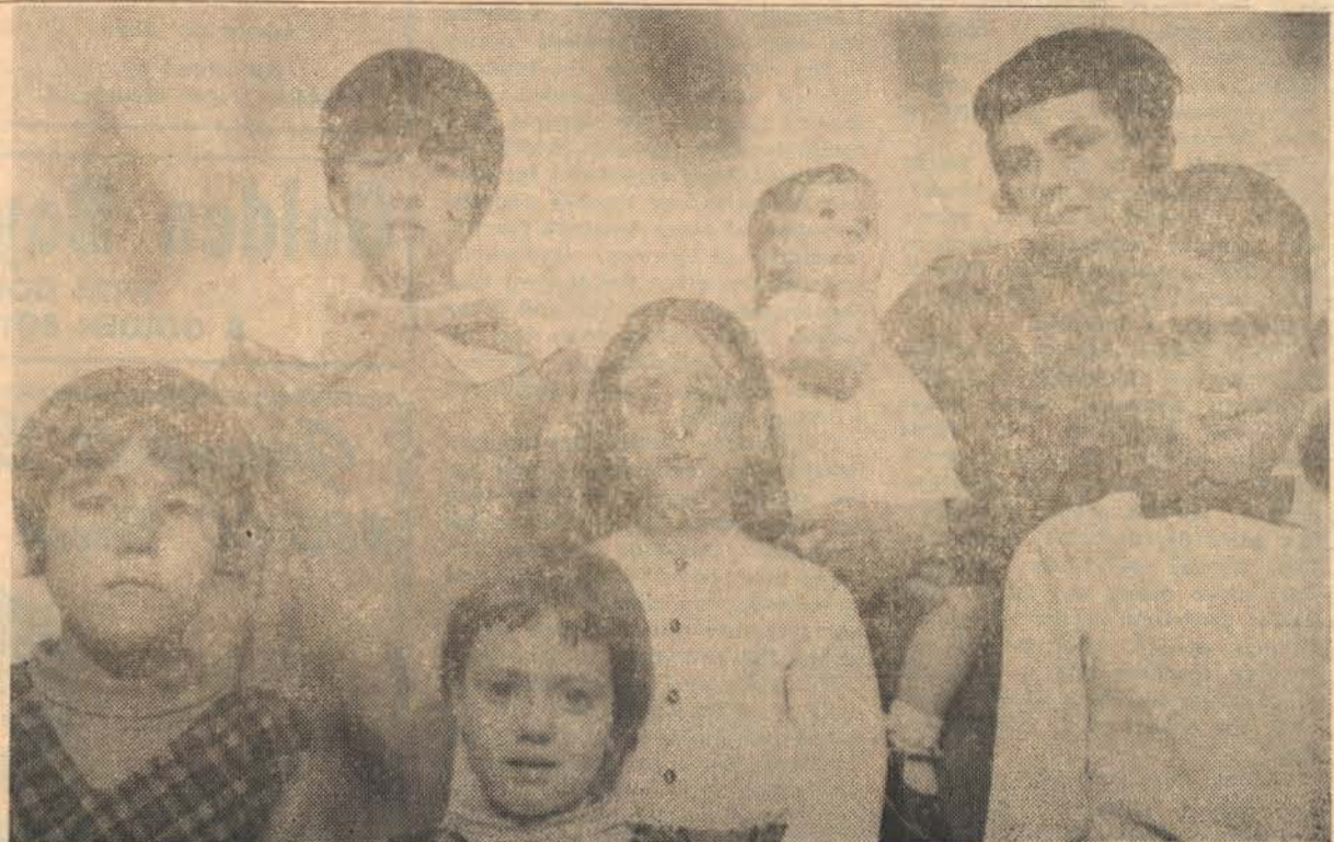
"I believe that human life is sacred and I don't want my children to kill or be killed in a senseless war."