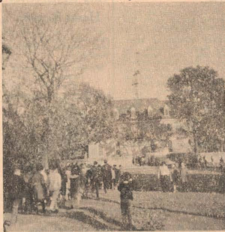
Eighth graders visit Williamsburg, Va., here approaching Governor's Palace.

Other highlights of the tour included a visit to the State Court of Appeals, Maryland's Supreme Court, the historic capitol building and a peek at the selection of a jury at a county court session.