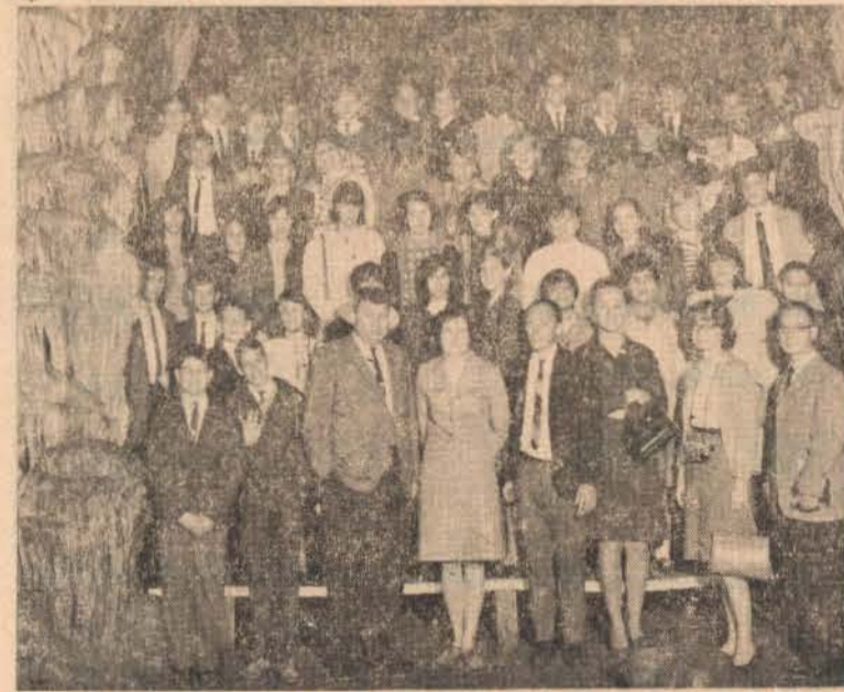
Seventh graders pose in Luray Caverns on trip that also included Monticello.