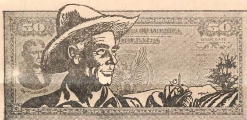
Money to insure that our productive power will thrive. . . .