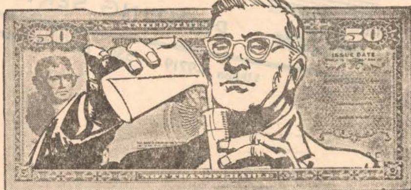
Money to let our scientists continue their search for answers. . . .