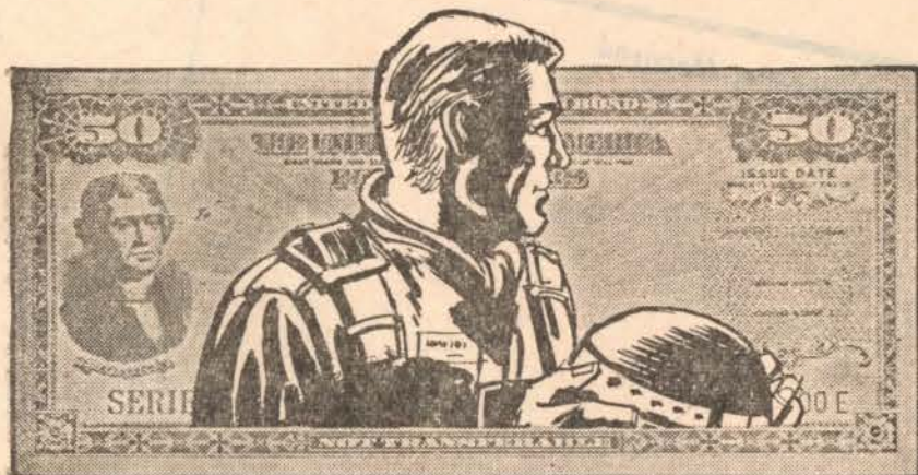
It takes money to keep our jet pilots patrolling the skies. . . .