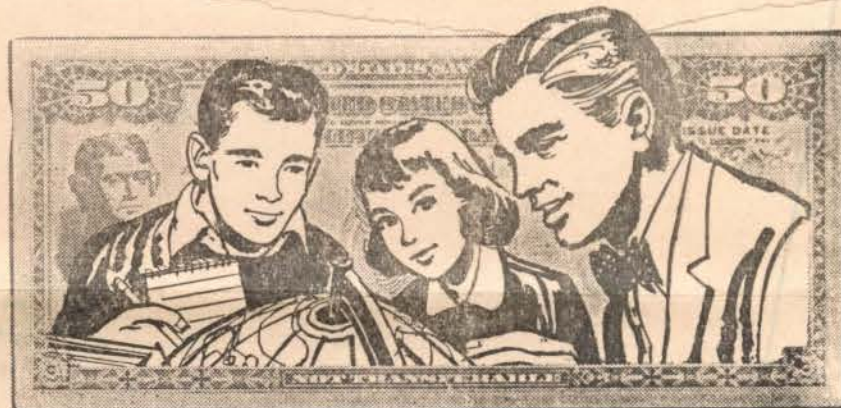
Money to help our children learn how to make peace lasting.

Yes, peace costs money. Money for research and schools and military preparedness. Money saved by you to keep our economy strong