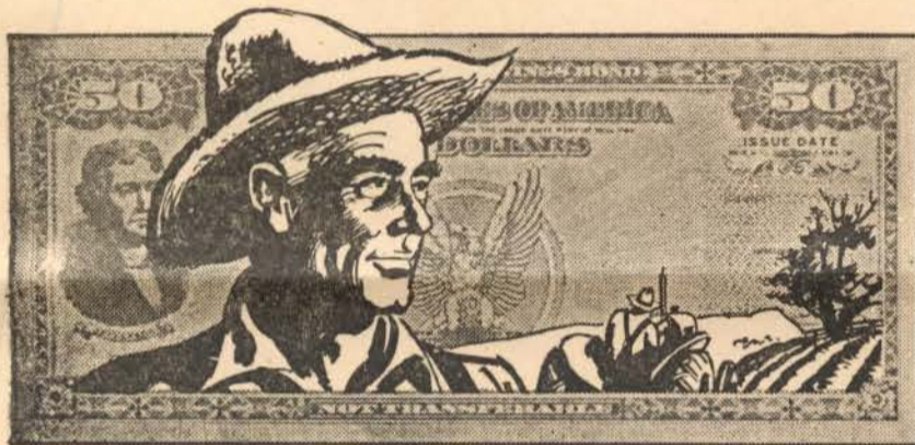
Money to insure that our productive power will thrive. . . .