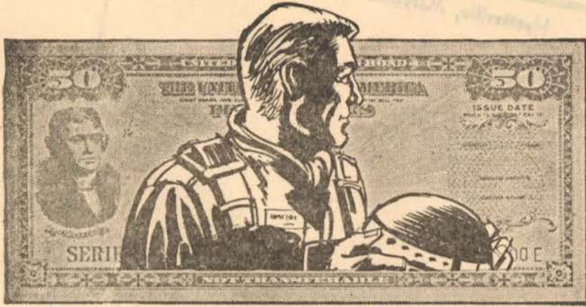
It takes money to keep our jet pilots patrolling the skies. . . .