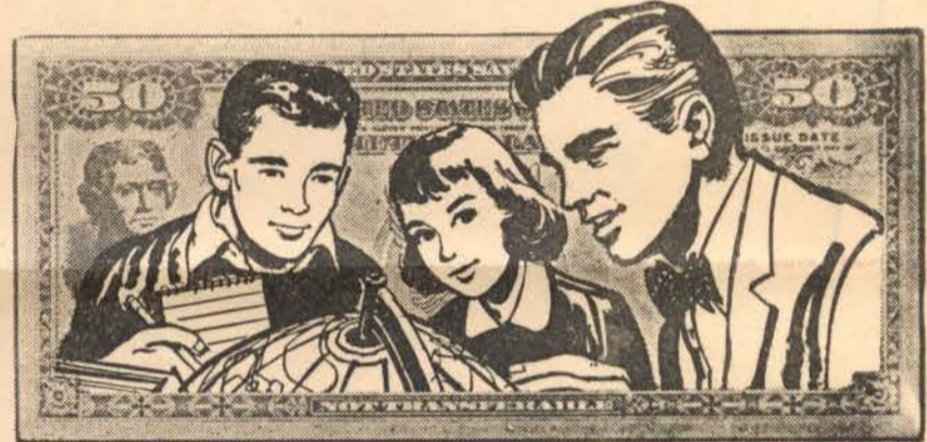
Money to help our children learn how to make peace lasting.

Yes, peace costs money. Money for research and schools and military preparedness. Money saved by you to keep our economy strong