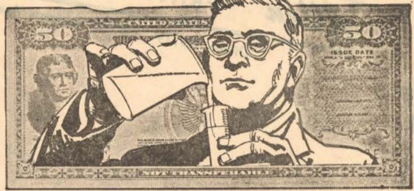
Money to let our scientists continue their search for answers. . . .