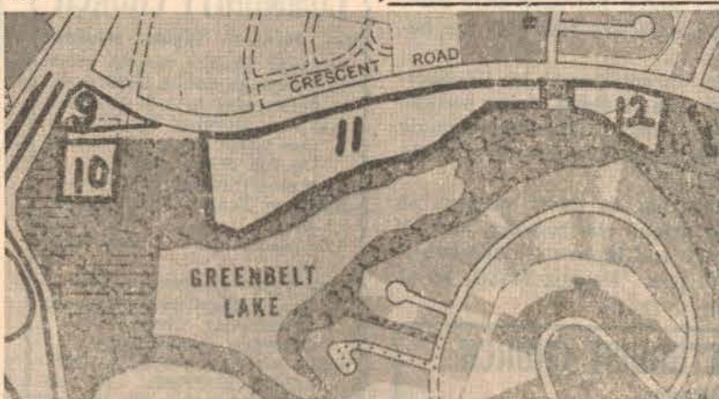
Shown above is the location of the proposed hospital on parcel 11. Hearings on the special zoning exception for the hospital will be held in Hyattsville on Friday, March 18.