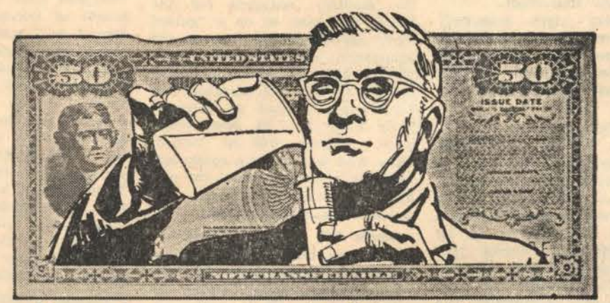
Money to let our scientists continue their search for answers....