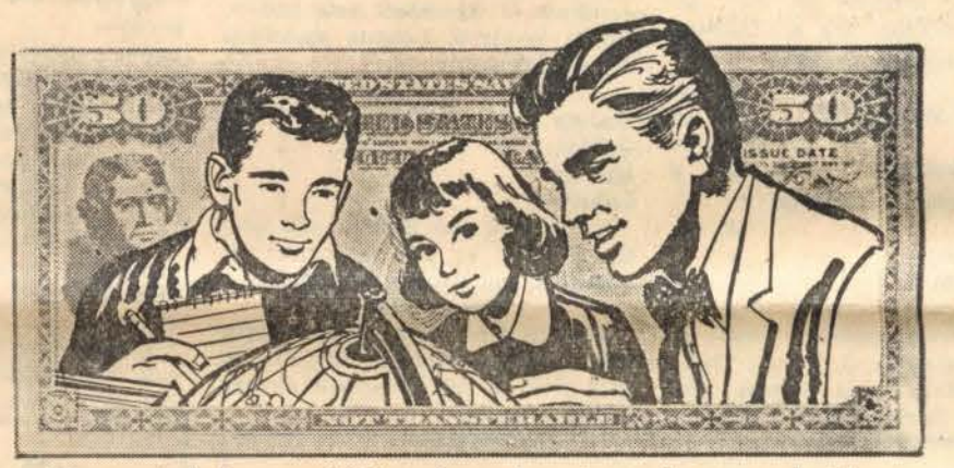
Money to help our children learn how to make peace lasting.

Yes, peace costs money. Money for research and schools and military preparedness. Money saved by you to keep our economy strong