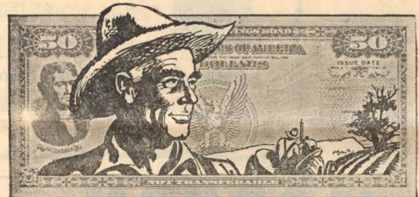
Money to insure that our productive power will thrive. . . .