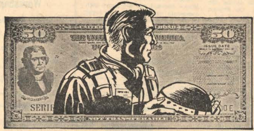
It takes money to keep our jet pilots patrolling the skies. . . .