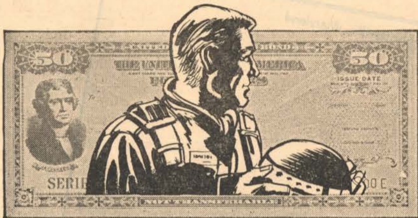
It takes money to keep our jet pilots patrolling the skies. . . .