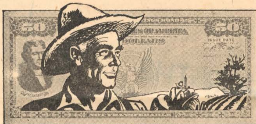
Money to insure that our productive power will thrive. . . .