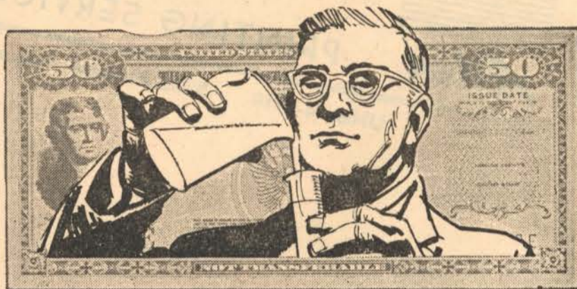
Money to let our scientists continue their search for answers. . . .