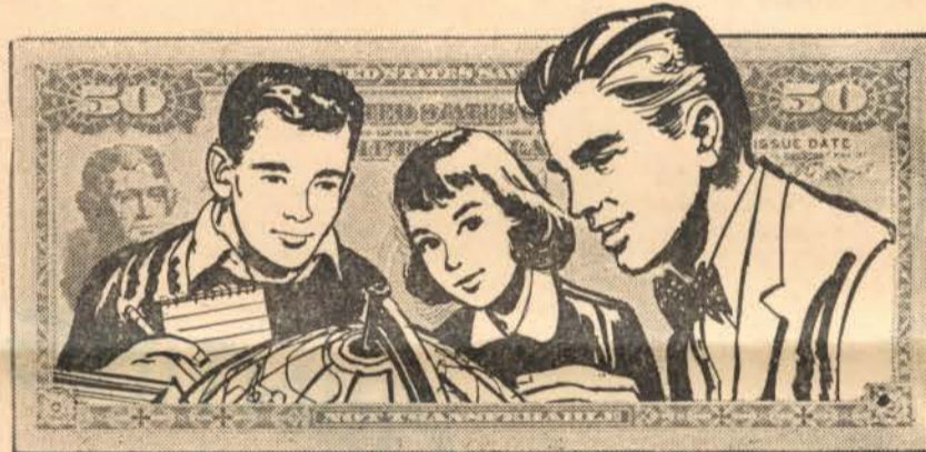
Money to help our children learn how to make peace lasting.

Yes, peace costs money. Money for research and schools and military preparedness. Money saved by you to keep our economy strong You and your family can be the strongest force of all for peace. Every Savings Bond you buy helps America keep peace in this troubled world. Think it over. Are you buying as many as you might ?