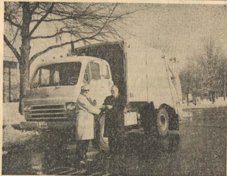
New Refuse Truck

Thursday, January 14, 8 p.m. G.H.I. Board Meeting, Hamilton Pl. 8 p.m. Woman's Club Meeting, 119 Northway Monday, January 18, 8 p.m. City Council Meeting 8 p.m. League of Women Voters, 11714 Roby Ave., Beltsville Thursday, January 21, 8 p.m. Lecture at St. Hugh's 10:30 a.m. - Hearing on Jaeger Tract Court of Appeals - Annapolis