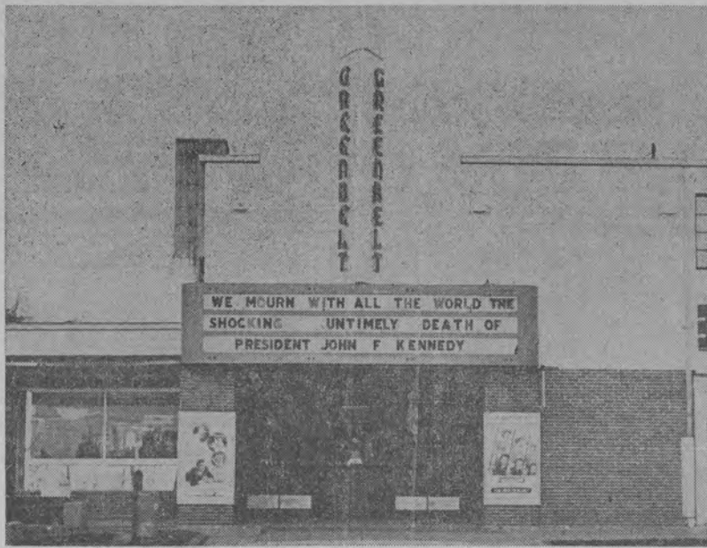
The Greenbelt Theatre expressed the feelings of the entire community last week.