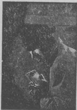
U.S. Savings Bonds are theft-proof! Fire-proof and loss-proof, too. Since 1941 the Treasury Department has replaced almost 1½ million Bonds at no cost to the owners.