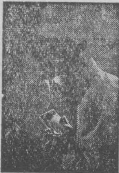
U.S. Savings Bonds are theft-proof! Fire-proof and loss-proof, too. Since 1941 the Treasury Department has replaced almost 1½ million Bonds at no cost to the owners.