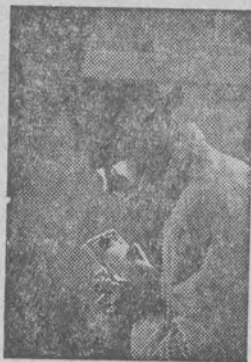
U.S. Savings Bonds are theft-proof! Fire-proof and loss-proof, too. Since 1941 the Treasury Department has replaced almost 1½ million Bonds at no cost to the owners.