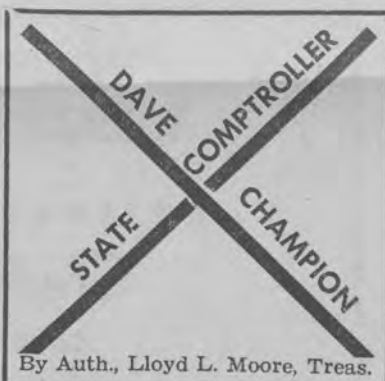
By Auth., Lloyd L. Moore, Treas.

35. To limit for park and recreational purposes the use of the land surrounding Greenbelt Lake except the portions now under development.