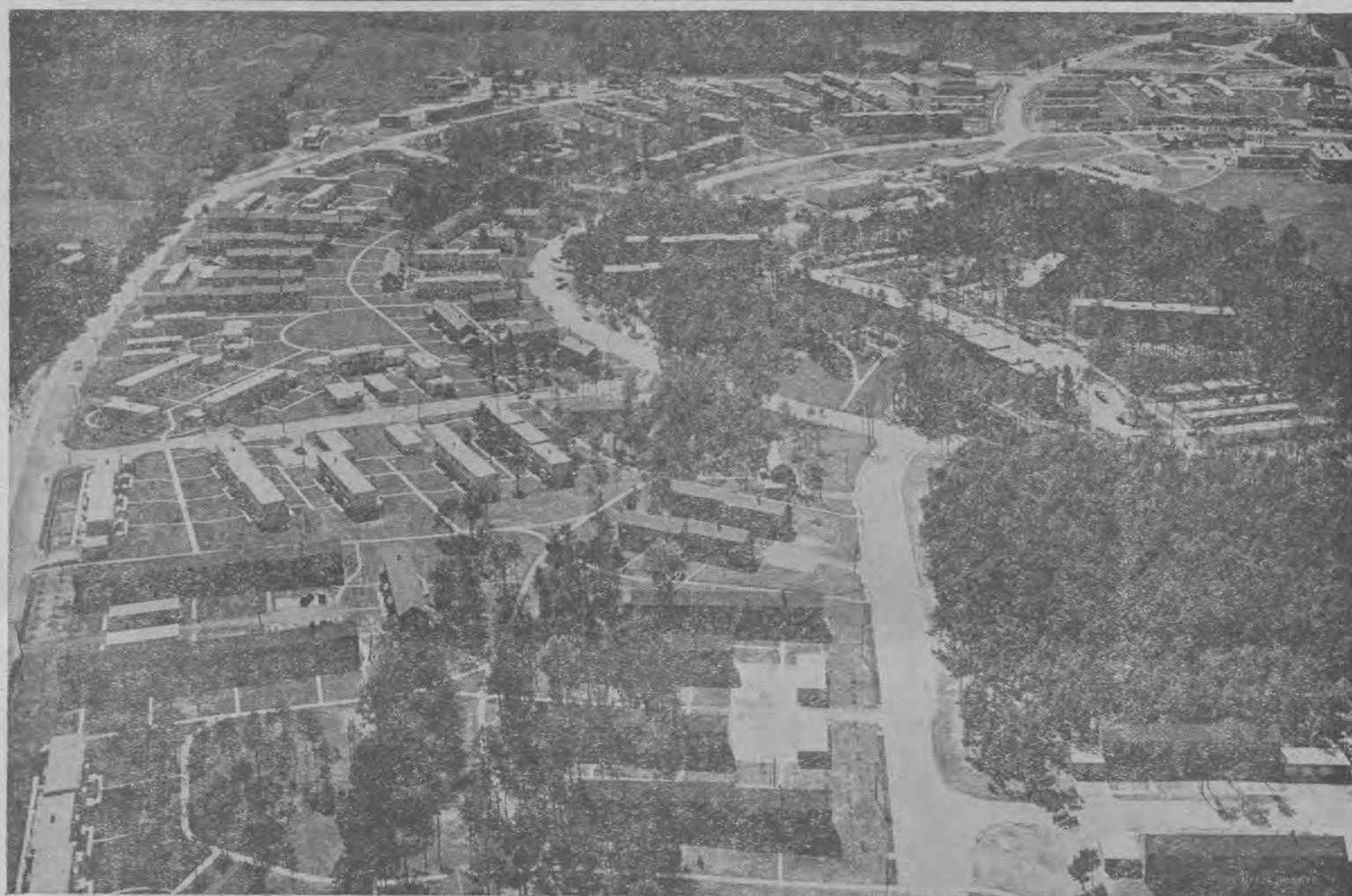
Airview of Greenbelt, made in September 1937 just before the project was opened for occupancy. On left are brick and cinder block homes. In right foreground is Hillside Rd., looking toward shopping center and Southway at upper right.

formed in the early months were Boy Scout Troop 202 and Cub Pack 202, sponsored by the Citizens' Association, and Girl Scout Troop No. 17. A source of entertainment to the community was a neighborhood little theater group, the Greenbelt Players, which put on a series of productions until the war years. Among other recreational groups were an athletic club, a camera club, hobby club, bridge club, garden club, rifle and gun club, and a radio club.