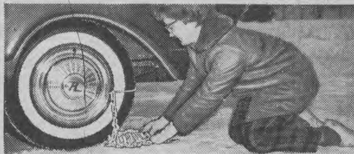
3. It is wise to gather the cross chains up close in back of tire on some cars, so chains won't catch on back of fender when car is moved forward to encircle the rear wheels.