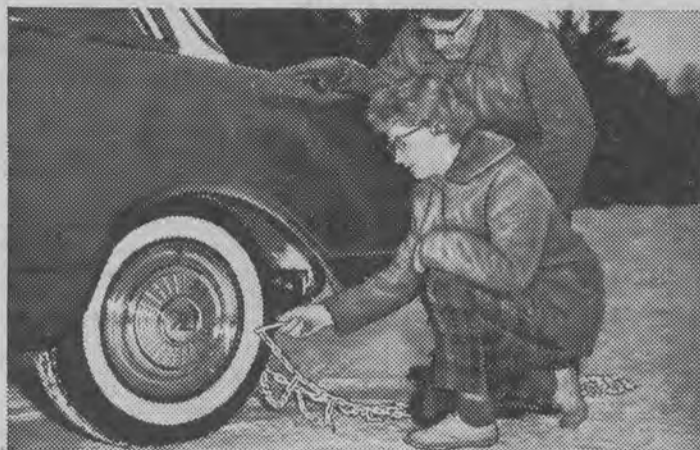
2. Then put end links of side chains on loops of "applier" and push onto tire as shown. No jack is needed.