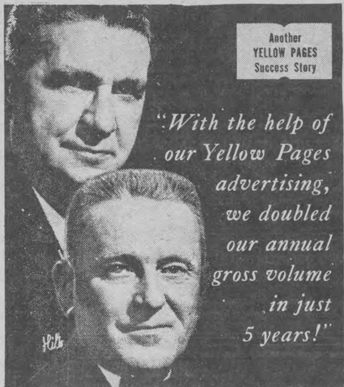
Another YELLOW PAGES Success Story

"With the help of our Yellow Pages advertising, we doubled our annual gross volume in just 5 years!"