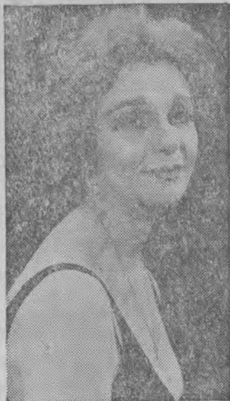
Geraldine Page as Alexandra del Lago in Tennessee Williams' "Sweet Bird of Youth" which plays the National Theatre, Washington, for two weeks beginning Monday, May 9.

For her performance of The Princess Kosmonopolis in "Sweet Bird of Youth," Geraldine Page won the 1958-59 Variety poll of the N. Y. drama critics for the best Broadway performance of the year by any actress. She was last seen in Washington as co-star with Eric Portman in "Separate Tables." Sidney Blackmer has attained distinction on the stage, in motion pictures, radio and television. Now basking in his first stellar billing, Rip Torn is widely known for his acting in television dramas.