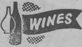
TABLE WINES SPECIAL

NAPOLEON BRAND COGNAC PRODUCT OF FRANCE $4.49 a fifth