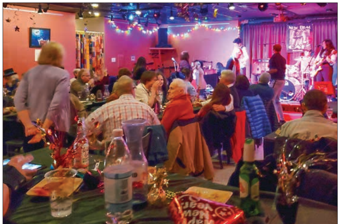
New Year's Eve revelers welcome the new year while enjoying the music of Honey Sol as well as delicious food and drink at the New Deal Café.