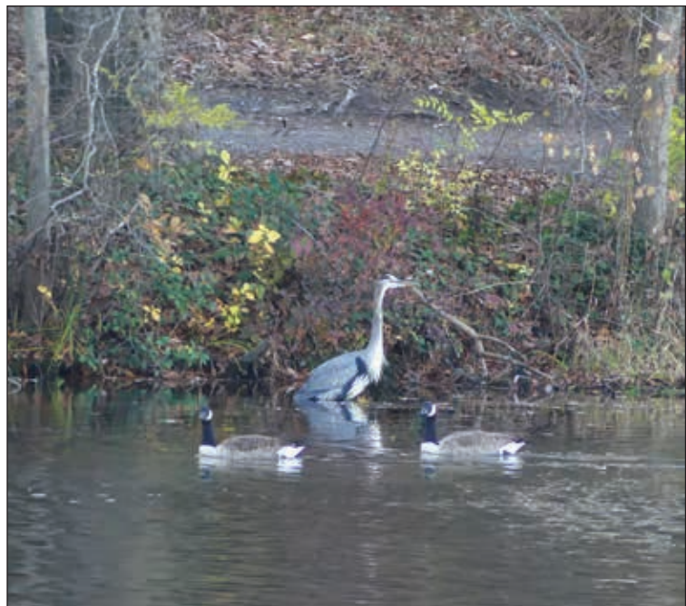
Canada geese on the Lake ignore a great blue heron, who returns the favor.