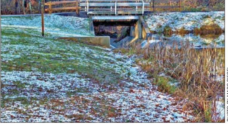
A dusting of snow is seen at Buddy Attick Park on Monday.

"Decisions to delay or close schools are never taken lightly, and are always made with the safety of students and staff as our first priority," said the PGCPS email. Parents who did not receive notification of the delayed opening are advised to check that their contact information in the SchoolMax Family Portal is accurate and to sign up for emergency alerts via phone and text message at asp.schoolmessenger. com/pgcps/subscriber.