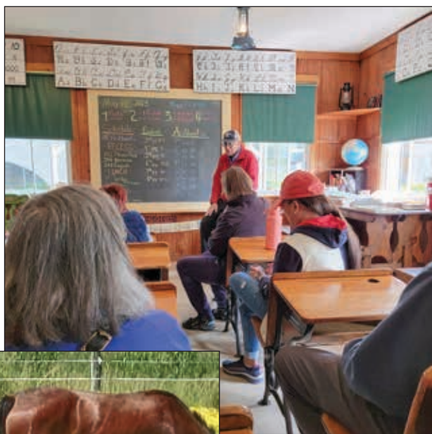
Greenbelters visit an Amish classroom.

Then we ate a hearty meal – we were so full, quite a few of us slept on the ride back.