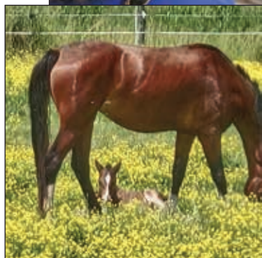
A mare and foal graze in an Amish field.