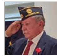
Memorial Day, p.16