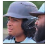
ERHS sports, p.15