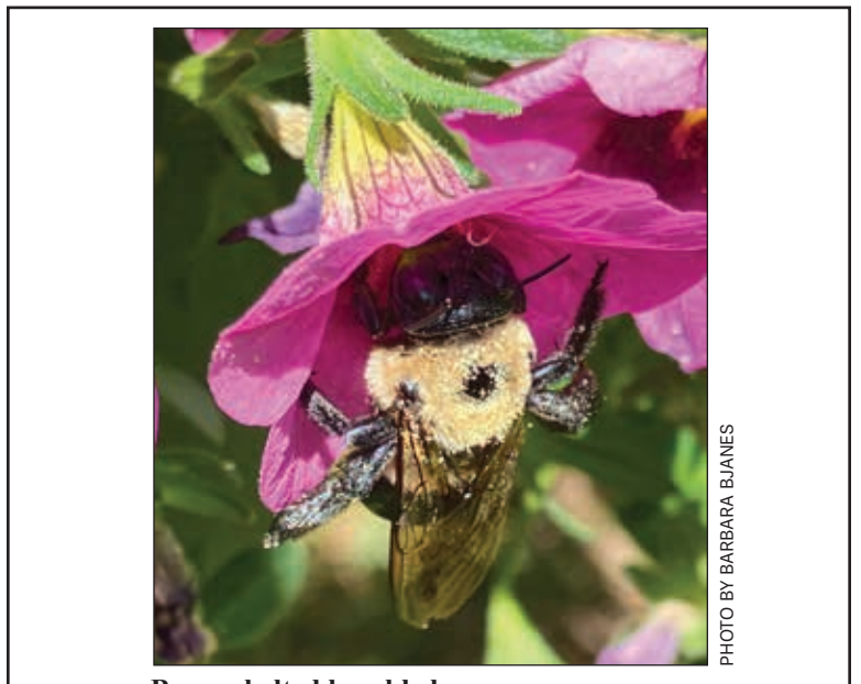
Brown-belted bumble bee