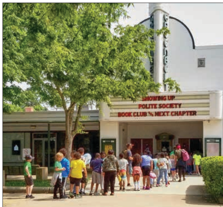
Local students visit the Old Greenbelt Theatre.

See the city ad on page 5 or the meetings calendar at greenbeltnmd.gov for more information.